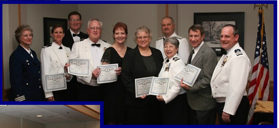
Change of Watch Dinner