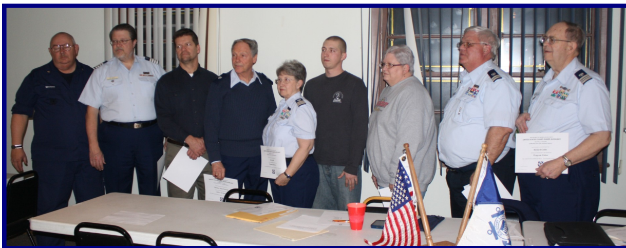
Swearing in of the Flotilla Officers