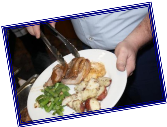
Some of the photos of the fine meal and fellowship had at the Awards Dinner