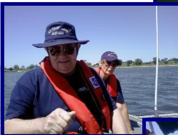
Getting the scoop on anchoring