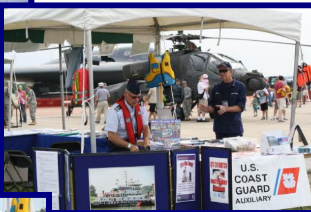
Exhibit at the 2011 Offutt Air Show