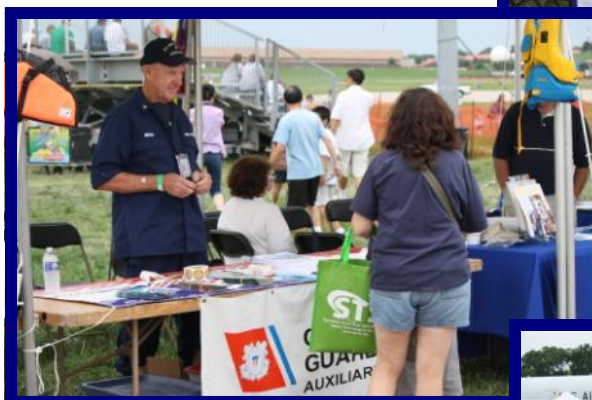
Visitors to the Coast Guard Auxiliary Exhibit at the 2011 Offutt Air Show