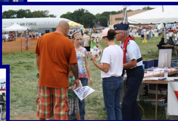
Visitors to the Coast Guard Auxiliary Exhibit at the 2011 Offutt Air Show