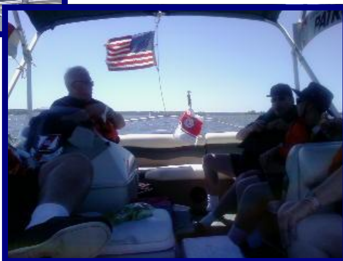
Discussion and training on man overboard.