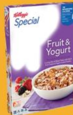
Hot and Cold Cereal

brown & white rice, pasta, macaroni & cheese