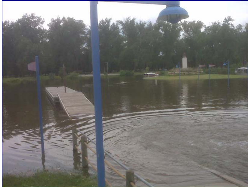
AUX Station Omaha.