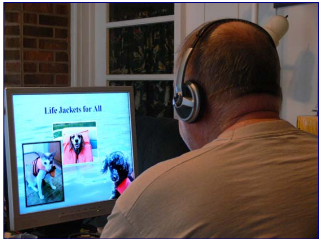
Submitted by Ralph Tomlinson

The next class, AUXWEA, began July 13. It will run for four weeks and then you are strongly encouraged to immediately take the test. A review group of questions is covered during the last session so you are prepared. Following AUXWEA, the new AUXCOM course will be offered. Keep checking the district's website for future classes.