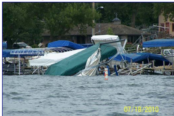
Fred Busy Photographer. See story on page 16.